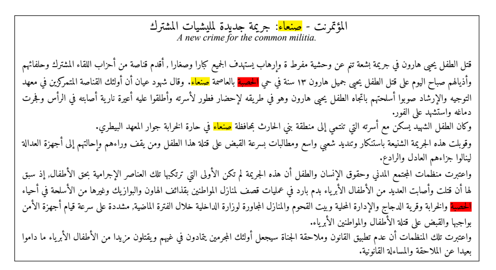
Fig. 2. A False Positive example: there is a confusion because a city is named "Measles".

Fig. 1. An example of True Positive: Measles in Saudi Arabia.